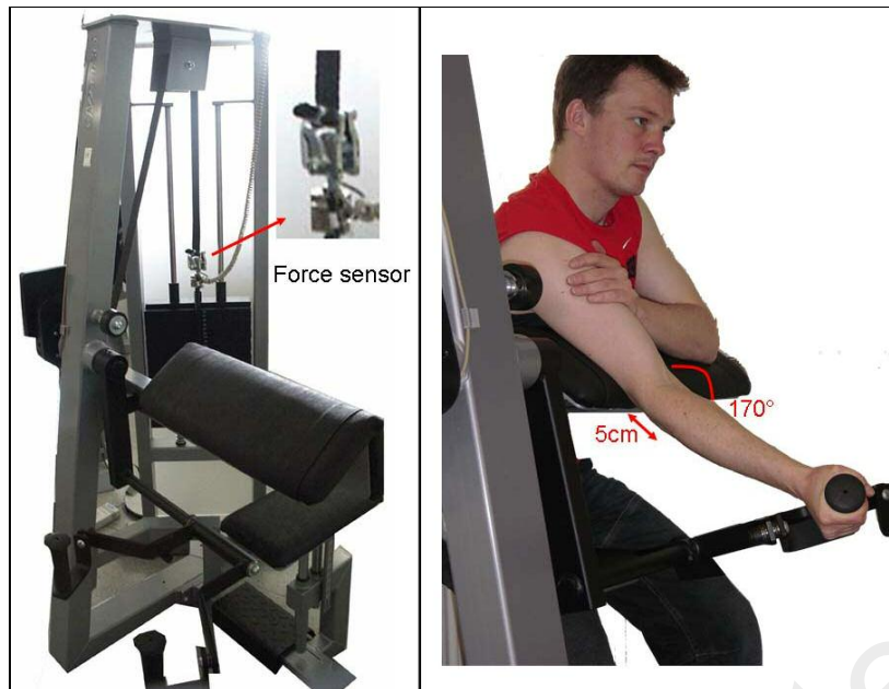
Figure 2. Test machine with force sensor (left); Right: measurement position.

surement (pretest vs T1 vs T2 vs T3 vs post-test vs. retest) was treated as within-subject factor. Cohen's f was calculated as an effect size for all F -values larger than 1.0. Maximal force was used as the dependent variable. Post hoc analyses were carried out using the Tukey's HSD post-hoc test because of its greater power and control for Type I error inflation compared to other post-hoc tests.