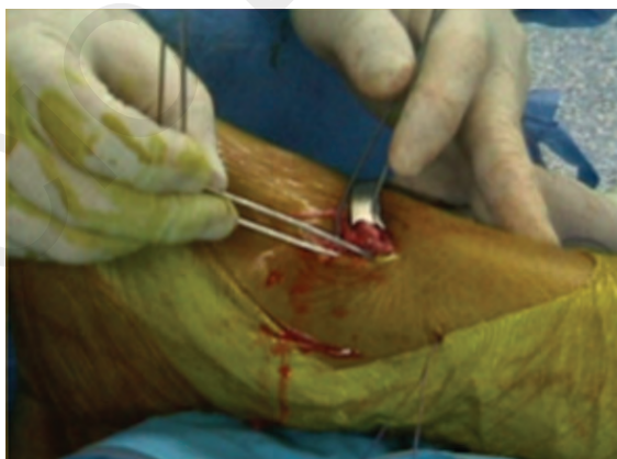
Figure 1. Bilateral insertion of two looped K-wires on the proximal stump of the achilles tendon.

In all cases, the tendon rupture occurred during sport activities: in particular, in five cases (13.8%) during an official match and in 31 cases (86.2%) during training. Patients' sports activities are shown in Figure 2.