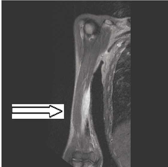
Figure 1. T1 IRTSE coronal magnetic resonance image showing biceps brachii tear and hematoma.